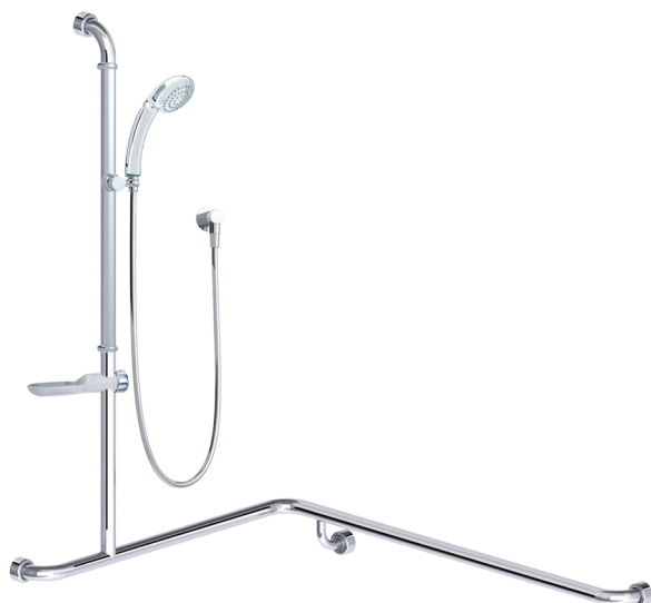
Drawn LH (Left Hand)